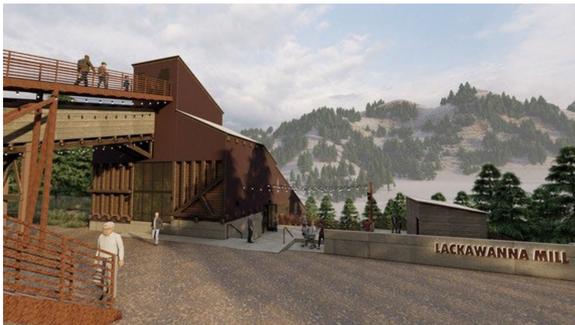
Rendering of possible redevelopment for the Lackawanna Mill Site - Brownfields project.

One key Brownfields projects is the Lackawanna Mill Site, which sits outside the BPMD site boundary but overlooks the Town of Silverton. A conceptual design was produced to reflect community feedback and ideas, including future uses such as a recreation hub, event space, and public gathering area. Assessment of the mill site was completed in January of 2025 through an EPA Brownfields grant awarded to the Town of Silverton. A structural analysis of the mill building is planned for summer of 2025. The results will help guide cleanup strategies and determine how the site may be reused in the future