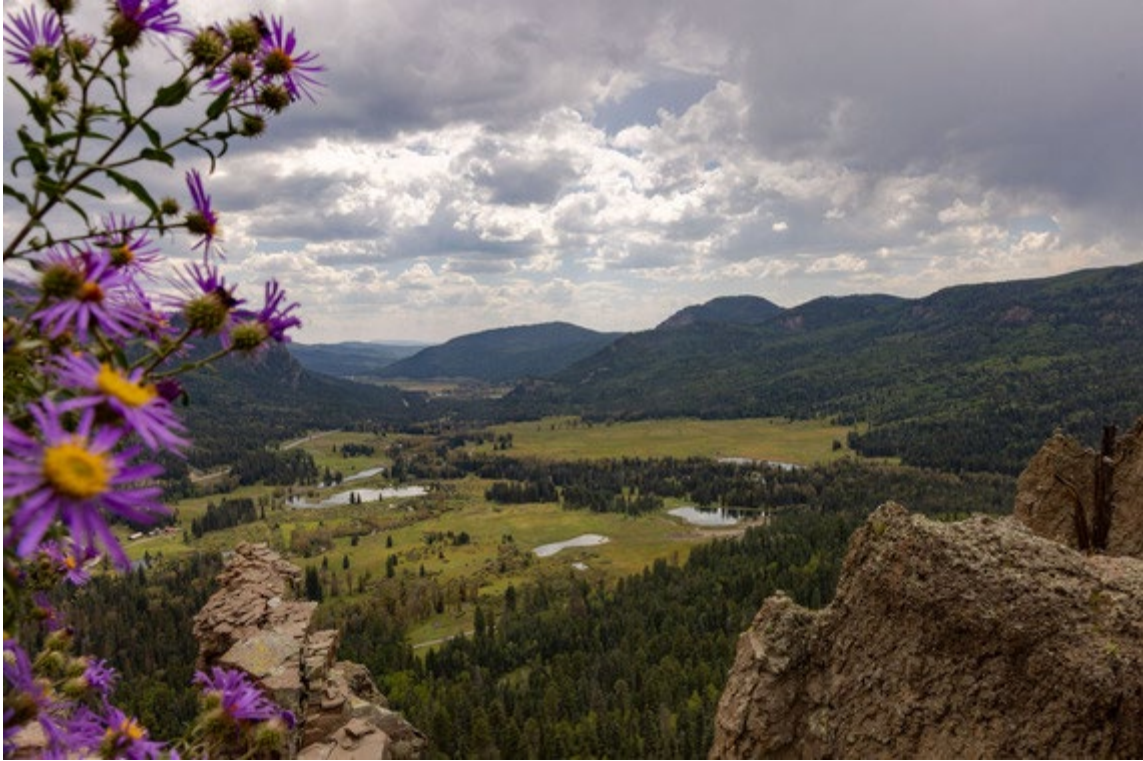
Bonita Peak Mining District Superfund Site