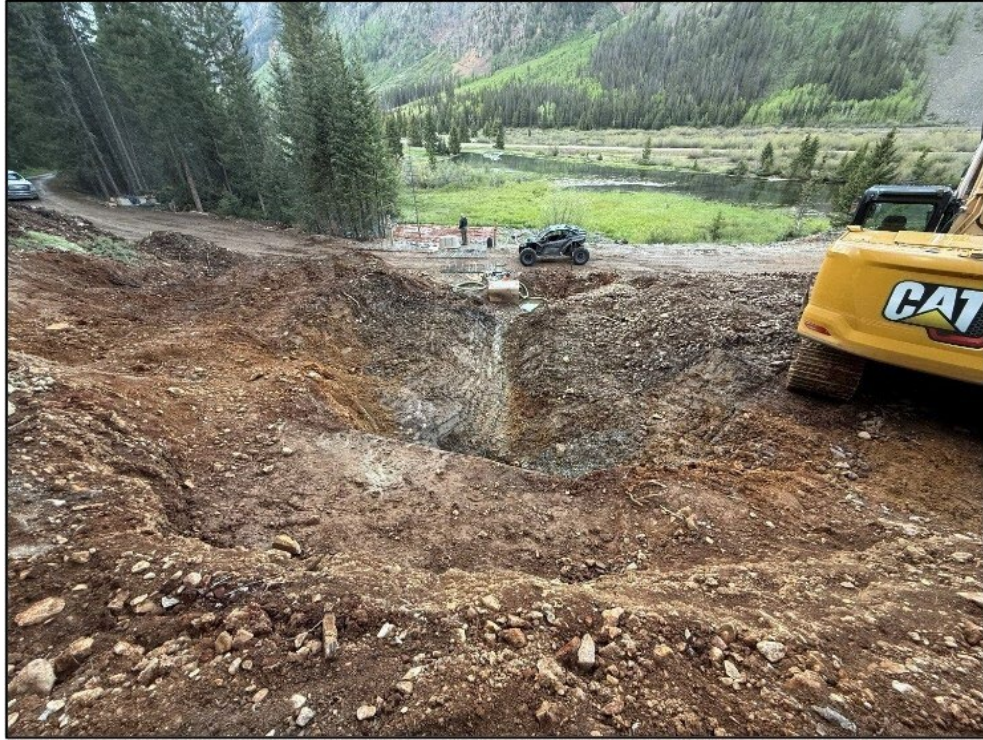
The Forest Queen Mine Cleanup Project - Photo captured on June 11, 2025